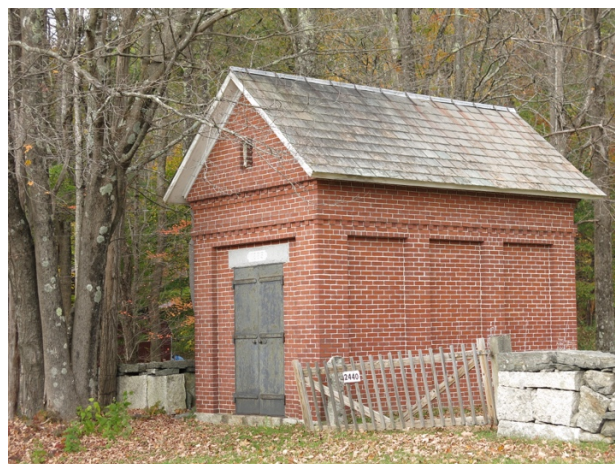
The Tomb at Maple Grove Cemetery

From 1864-1883 the cemeteries in town were run by a Cemetery Committee. On December 11, 1883, five commissioners were elected and then on March 4, 1884, five commissioners were elected just for Maple Grove. This system lasted until the 1970's when the system changed back to one commission for all thirteen of the town cemeteries.