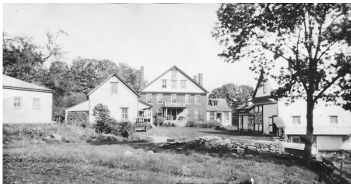
The William B. & Matilda Lawrence Farm