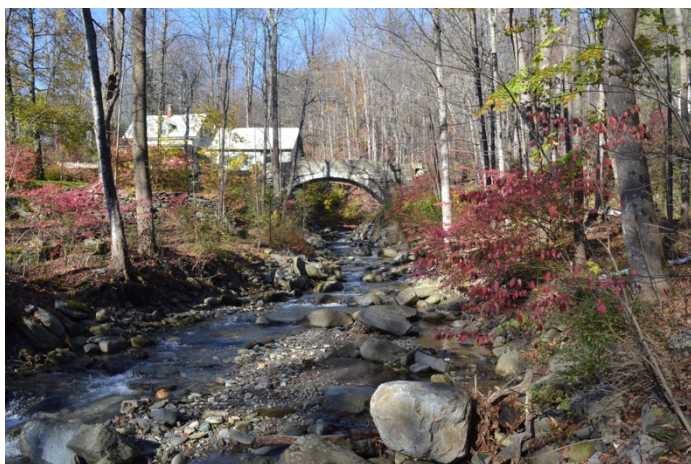
West Townshend Stone Arch Bridge