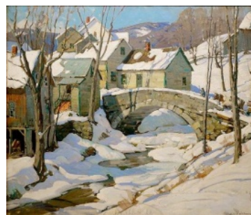
West Townshend Stone Arch Bridge