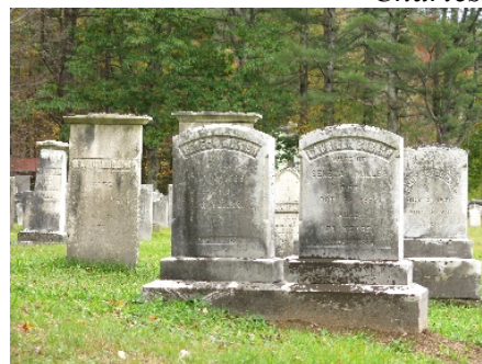
Maple Grove Cemetery