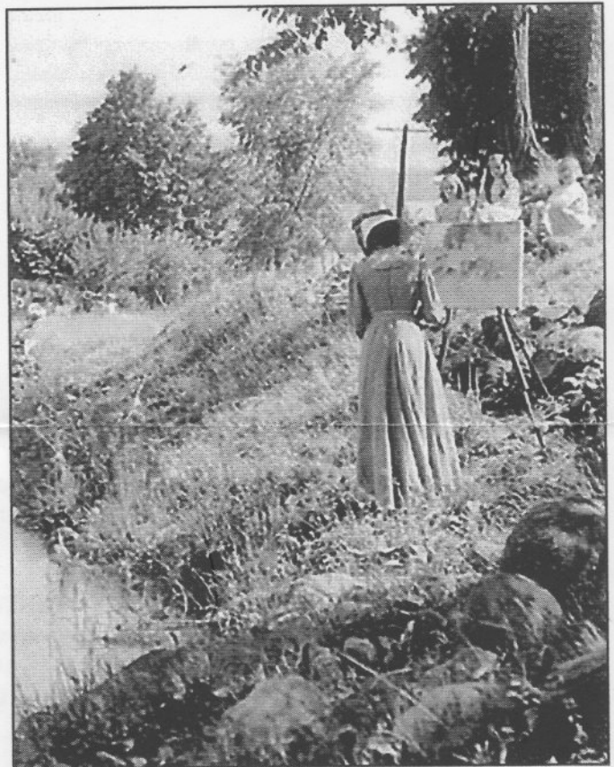
Lucy painting by the pond, children looking on

Taft Hill Collection and Fine Art Gallery is located one mile south of the Townshend Common at 1096 Route 30. The gallery is open daily from 10 to 5.